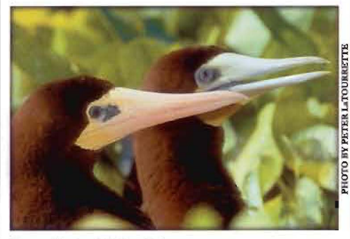
Brown Booby, Mating Pair

Boobies are found the world over, primarily in the tropics. Boobies are pelagic seabirds that come to the shores of the CNMI to nest and roost. Boobies feed on fish and squid by diving into the water. They like to feed near