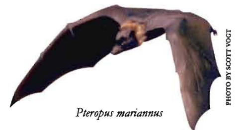
* Distribution in the CNMI * Locally extinct

The Mariana fruit bat is locally listed as an endangered species due to the decline in population. Under local law it is illegal to hunt the fruit bat anywhere in the CNMI. It is also illegal to discharge any weapon within five hundred meters of a known, occupied bat roost. The U.S. Fish and Wildlife Service proposed to have the Mariana fruit bat listed as a Federally threatened species and efforts for conservation are being made.