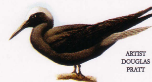
Black Noddy Anous minutus